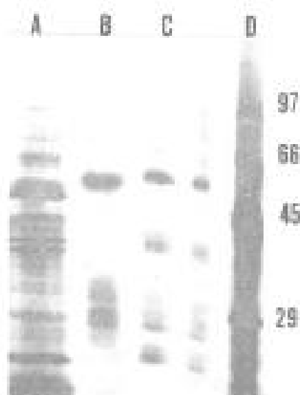
Fig. 2. SDS-PAGE analysis of the purified yeast derived HBsAg. A) total soluble extract from yeast cells expressing HBsAg. B) HBsAg isolated from a human carrier and C) purified recombinant yeast derived HBsAg. D) Molecular weight markers (kDa).

The sequence of the isolated HBsAg gene and its comparison to the reported sequence of the HBV subtype ayw (Gene bank accession number: X0ZH96) is shown in fig 1. The gene isolated in our study shows more than 90% homology with the reported ayw subtype. The primers used are shown underlined.