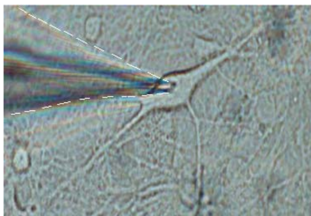
Fig. 1. Phase contrast image of a cultured hippocampal neuron with a patch pipette attached to the membrane of neuron ready for recording.