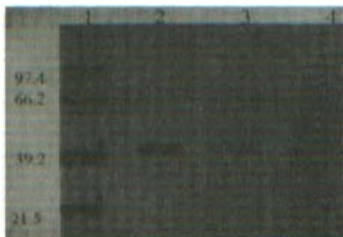
Fig. 3. Silver stained SDS-PAGE. Lane 1, protein marker; lane 2, purified PheDH; lane 3, batch-wise Reactive Blue 4; lane 4, cell free extract.

Expression and purification. The product of pETDH gene was determined by measuring the oxidative activity of NADH as an indicator [10], and was purified to near homogeneity with a final yield of 28% (Fig. 3). The purification steps and the yields are presented in Table 1.