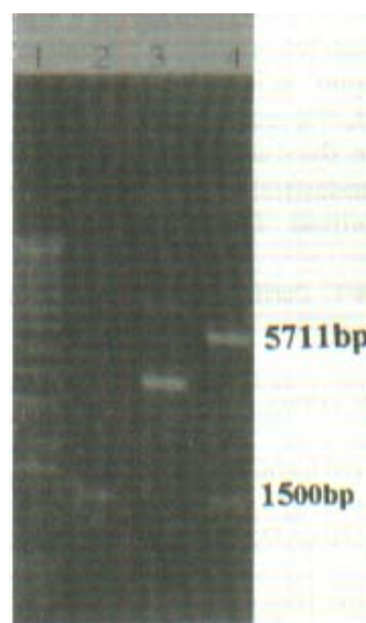
Fig. 2. Agarose gel analysis of construct and vector: Lane 1, one kbp marker; Lane 2, pdh insert; Lane 3, pETDH uncut; Lane 4, pETDH Bam HI cut.