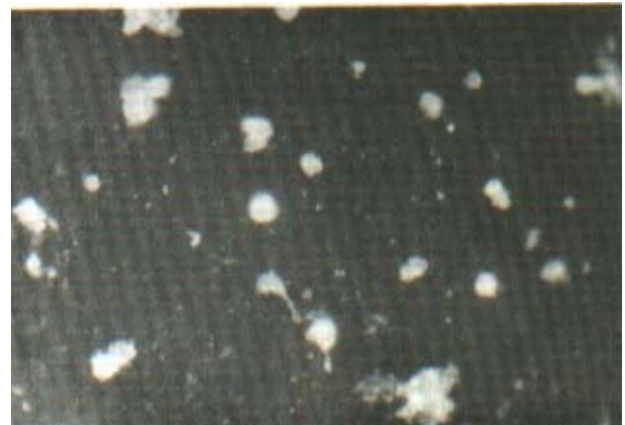
Fig. 2. The reactivity of type A influenza nucleoprotein monoclonal antibody with embryo cells presenting avian influenza virus antigens. The goat anti-mouse FITC IgG antibodies were used to visualize AIV antigen in indirect Immunofluorescence assay.

turkey flocks in Iran [14]. Aghakhan et al. [17] used three different H subtype antigens in HI test in order to demonstrate H subtype specific antibodies in sera prepared from commercial chicken flocks. A considerable number of the sera tested, showed low to moderate HI titers. However, the same sera showed negative reaction in HI test when the sera treated with the receptor destroying enzyme. Besides, no positive reaction was observed in AGP test. According to the sensitivity and specificity of the test used and their AI survey between 1974-1994, they suggested that AIV were not exit in Iran.