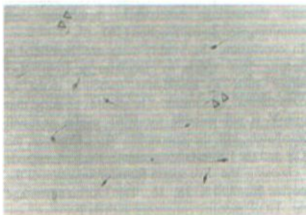
Fig. 1. Light microscopy of spermatozoa stained with eosin-Y. Arrows pointing non-stained live sperm. 400.

Paired t-test was applied to compare the results using SPSS for windows version 6.0 and the significance differences were expressed at the level of p < 0.05 .