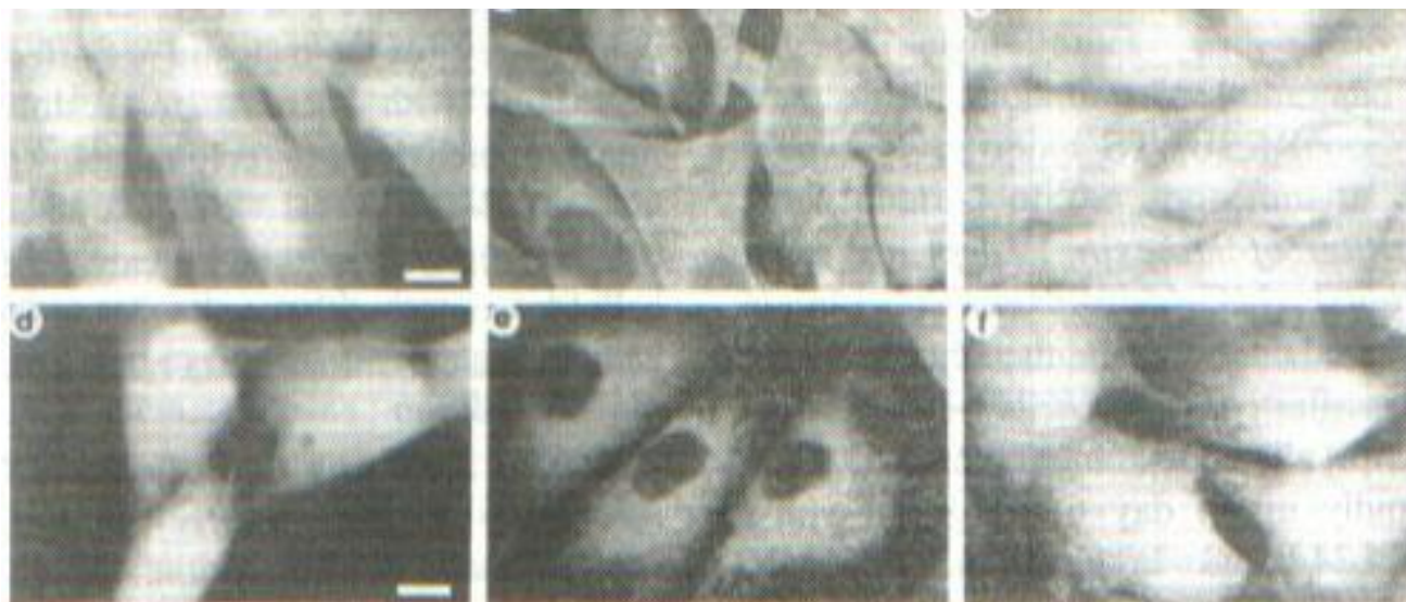
Fig. 2. Location of annexin V in MG-63 cells. MG-63 cells were subcultured in DMEM containing 10% FCS and refed after 3 days. Immunofluorescence was performed on: (a, d) cells 3 days after passaging, (b) confluent cells 9 days after passaging without a further change of medium and (c) confluent cells as in (b) 24 h after refeding with DMEM containing 10% FCS. In (e), cells were passaged and allowed to grow for 3 days in DMEM containing 10% FCS. On the third day, cells were washed and refed with medium containing no FCS and maintained for further 3 days. In (f), cells were treated as in (e), then refed with medium containing 10% FCS and maintained for a further 24 h. Scale bars in (a) and (d) are representative for all panels of the figure and indicate 10 \mu m.