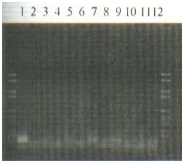
Fig. 2. PCR product of HPV DNA from esophageal carcinoma. Lane 1, positive control; Lane 2, negative control; Lanes 3, 5, 7, 8, 9, 10, 12, positive patient samples; Lane 4, 6, 11, negative patient samples.

The mixture was denatured at 94°C for 5 min, followed by 40 cycles of amplification using a PCR processor Bio-Med (Perkin Elmer Cetus USA). Each cycle consisted of 94°C for 1.5 min, 40°C for 2 min, and 72°C for 1.5 min. The final elongation step was prolonged for 4 minutes to ensure complete extension of the amplified product. Samples processing prior to and after the amplification reactions were performed in strictly separated rooms to avoid contamination by PCR products. Samples containing distilled water were used as negative controls. Ten µl of each PCR mixture was finally analyzed by 1.5% agarose gel electrophoresis [24] (Fig. 2).