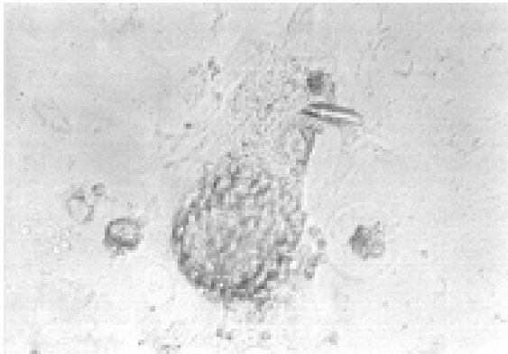
Fig. 1. Morphology of an ICM colony was illustrated 72 h after culturing of hatched blastocyst. Magnification \times 100 .

After embryo hatching, there were two morphologically distinct cell types: inner cell mass colonies and trophoblast cells. The latter attached to surface of plate as a monolayer. The ICM cell colonies were small cells with a large nucleus and minimal amount of cytoplasm (Fig. 1) and were tightly packed. The morphology of ICM colonies in the first, second and third subculture was similar. However, after the fourth subculture, they formed a monolayer on the plate. The hatched embryo (89%) formed ICM colonies and only 10% of these colonies could produce ES cells.