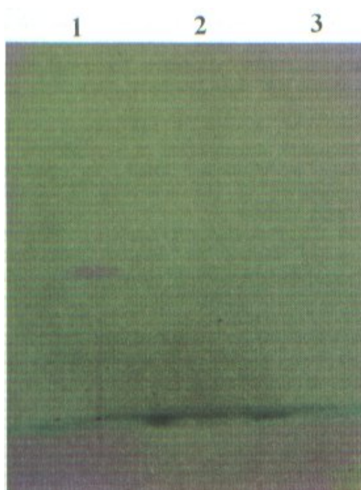
Fig. 2. Phenolphthalein staining. A sharp clear band is indicative of cyclodextrin production. There are not any bands in \alpha -amylase and glucoamylase lanes. Lane 1, cyclodextrin glucosyltransferase; lane 2, \alpha -amylase and lane 3, glucoamylase.