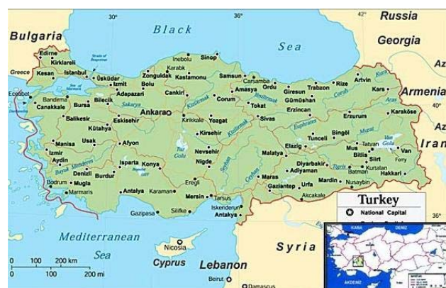
Fig. 1. Map of Isparta city in Turkey.

Biochemistry and serology. Liver biochemical tests including ALT (alanine transferase, range: 10-35 U/L) and AST (aspartate amino transferase, range: 10-40 U/L) were carried out for all patients. Serological markers for hepatitis viruses were tested with commercially available kits (AxSYM; Abbott Laboratories, North Chicago, IL, USA) for HBsAg, Hepatitis B early antigen (HBeAg), anti-HBc (IgM/IgM + IgG).