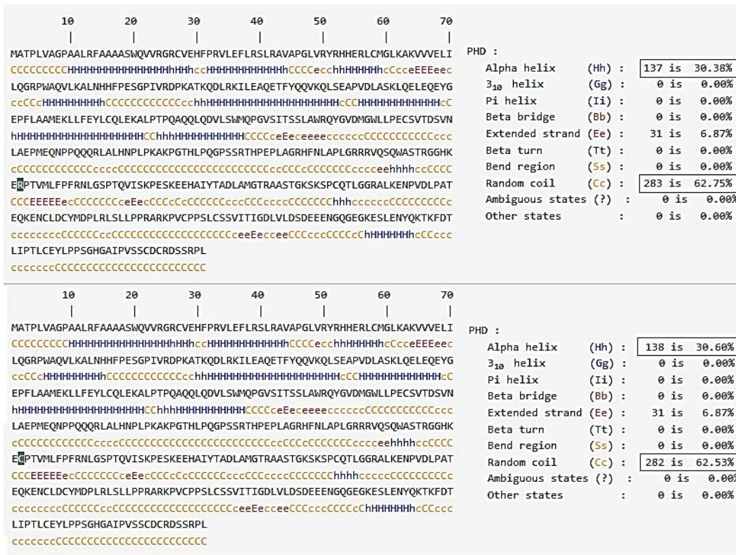
Fig. 3. Secondary structure statistics in wild-type (up) and mutant type (down) proteins. The numbers changed is shown in a rectangular shape.

TIN2L and TRF2 through F120. This is an important residue within TRFH domain of TRF2 known as a critical factor for the binding of TRF2 to Apollo and SLX4 [14,21] . There may be a competition between TIN2L and Apollo and SLX4 proteins for binding to TRF2 via the TRFH domain. Therefore, in patients who have the R282H mutation, the reduced interaction between TIN2L and TRF2 may decline TIN2L binding to TRF2 at the telomere, allowing an increase in recruitment of Apollo, SLX4, or other factors that likely contribute to telomere shortening. TIN2S and TIN2L have a similar interaction with TPP1, which is not influenced by either R282H or S396A. However, researchers have found very specific results concerning the interactions of TIN2S and TIN2L with TRF1 and TRF2, as well as the very specific effects of R282H or S396A on TIN2S and TIN2L interactions [14,20,22] . These findings reveal the great influence of the most common DC-associated TINF2 mutation on the ability of TIN2L, rather than TIN2S, to interact with the shelterin complex protein members