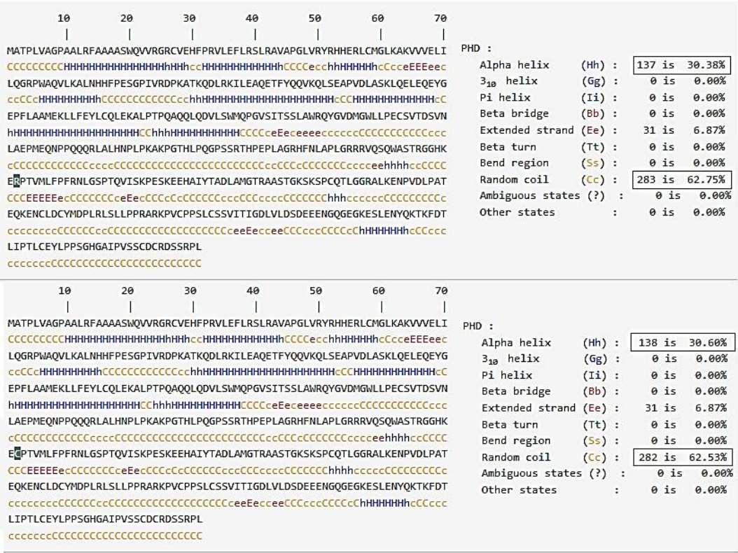
Fig. 3. Secondary structure statistics in wild-type (up) and mutant type (down) proteins. The numbers changed is shown in a rectangular shape.

TIN2L and TRF2 through F120. This is an important residue within TRFH domain of TRF2 known as a critical factor for the binding of TRF2 to Apollo and SLX4 [14,21] . There may be a competition between TIN2L and Apollo and SLX4 proteins for binding to TRF2 via the TRFH domain. Therefore, in patients who have the R282H mutation, the reduced interaction between TIN2L and TRF2 may decline TIN2L binding to TRF2 at the telomere, allowing an increase in recruitment of Apollo, SLX4, or other factors that likely contribute to telomere shortening. TIN2S and TIN2L have a similar interaction with TPP1, which is not influenced by either R282H or S396A. However, researchers have found very specific results concerning the interactions of TIN2S and TIN2L with TRF1 and TRF2, as well as the very specific effects of R282H or S396A on TIN2S and TIN2L interactions [14,20,22] . These findings reveal the great influence of the most common DC-associated TINF2 mutation on the ability of TIN2L, rather than TIN2S, to interact with the shelterin complex protein members. Telomeres play an important role in protecting the ends of chromosomes. Due to the surprising effects of very small changes in DNA, if the ends of chromosomes remain unprotected, the life of the cell and organism will be in danger. Various proteins and