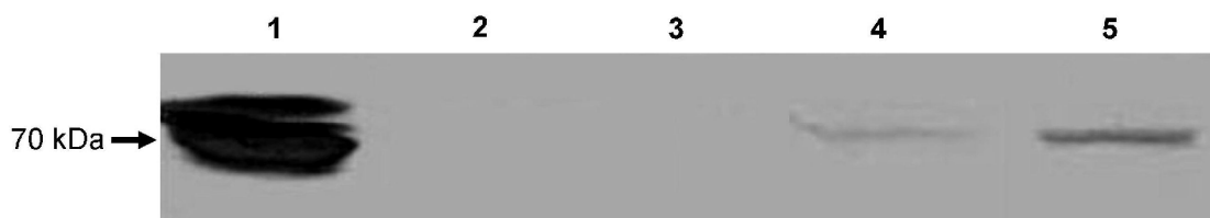
Fig. 3. Western-blot analysis of albumin production. Western-blot analysis was carried out on the conditioned medium of cells. Lane 1, normal human serum (1/100 diluted) as positive control; Lane 2, undifferentiated hESC cultured on mouse embryonic fibroblast (MEF) feeder layer; Lane 3, differentiated hESC without growth factors; Lane 4, differentiated hESC at day 21; Lane 5, differentiated hESC at day 28.