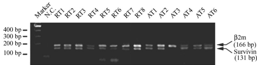
Fig 2. RT-PCR analysis of survivin in RT and AT samples. All of the RT and AT cases have undergone at least one chemotherapeutic program. Upper and lower bands correspond to the \beta 2m and survivin expression, respectively. One sample (AT3) was negative for survivin expression. RT, resected samples; AT, amputated samples; N.C., negative control.