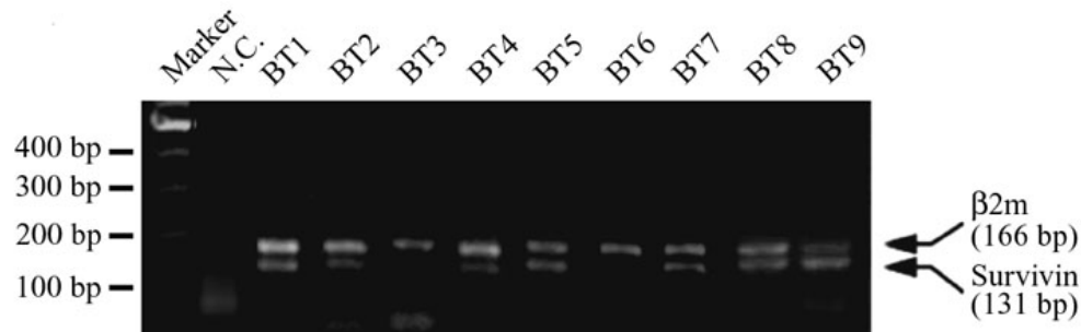
Fig 1. RT-PCR analysis of survivin expression in biopsy samples (BT1-9). Lane 1 corresponds to the DNA marker. Lower bands (131bp) in all lanes represent survivin, while the upper bands (166 bp) are related to \beta 2m. In negative control (N.C.) distilled water used instead of cDNA in PCR reaction. Note that, in addition to N.C. three of BT samples were also negative for lower band (survivin).

Hemi nested RT-PCR reaction. The same amount of the extracted RNA (24 \mu l) from each sample was used for cDNA synthesis. Reverse transcription was performed by reverse transcriptase enzyme (Fermentase Co., Lithuania) and specific primers for each gene including HBR for \beta 2m and HSR2 for survivin in one tube (40 \mu l final volume). First round of PCR was performed in a final volume of 50 \mu l and the reaction was followed as described previously [16]. PCR amplification of survivin was performed on Techne thermal cycler using HSR2 (as reverse primer) and HSF (as forward primer). The conditions of the reaction was as follows: initial denaturation at 94°C for 150 s, followed by 35 cycles of denaturation at 94°C for 30 s, annealing at 57°C for 60 s, extension at 72°C for 40 s and a final extension at 72°C for 5 minutes. PCR amplification conditions for \beta 2m were identical to the one described above except for using specific primers HBR and HBF1. Second round of PCR was performed similar to the one described for the first round of PCR except for using 30 cycles of reactions for both survivin and \beta 2m as well as using internal forward primers, HBF2 for \beta 2m and internal reverse primer for survivin.