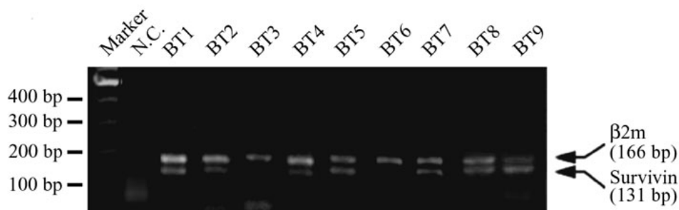
Fig 1. RT-PCR analysis of survivin expression in biopsy samples (BT1-9). Lane 1 corresponds to the DNA marker. Lower bands (131bp) in all lanes represent survivin, while the upper bands (166 bp) are related to \beta 2m. In negative control (N.C.) distilled water used instead of cDNA in PCR reaction. Note that, in addition to N.C. three of BT samples were also negative for lower band (survivin).

Hemi nested RT-PCR reaction. The same amount of the extracted RNA (24 \mu l) from each sample was used for cDNA synthesis. Reverse transcription was performed by reverse transcriptase enzyme (Fermentase Co., Lithuania) and specific primers for each gene including HBR for \beta 2m and HSR2 for survivin in one tube (40 \mu l final volume). First round of PCR was performed in a final volume of 50 \mu l and the reaction was followed as described previously [16]. PCR amplification of survivin was performed on Techne thermal cycler using HSR2 (as reverse primer) and HSF (as forward primer). The conditions of the reaction was as follows: initial denaturation at 94°C for 150 s, followed by 35 cycles of denaturation at 94°C for 30 s, annealing at 57°C for 60 s, extension at 72°C for 40 s and a final extension at 72°C for 5 minutes. PCR amplification conditions for \beta 2m were identical to the one described above except for using specific primers HBR and HBF1. Second round of PCR was performed similar to the one described for the first round of PCR except for using 30 cycles of reactions for both survivin and \beta 2m as well as using internal forward primers, HBF2 for \beta 2m and internal reverse primer for survivin.