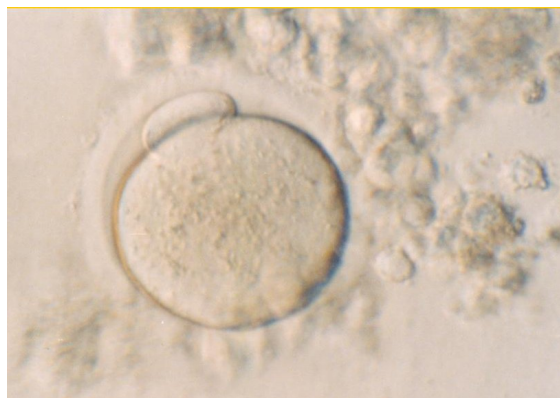
Fig. 3. MII oocyte Ovulated from the cultured fresh preantral follicle (16 h after hCG administration) \times 400 .

It seems that, LIF have no effect on survival and antrum formation rates of isolated preantral follicles in fresh and vitrified groups. Also, the results of our