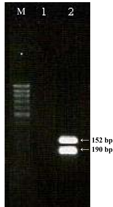
Fig. 3. Subtyping of avian influenza viruses in cloacal and tracheal swabs samples. Lane M, size markers (50 bp ladder, CinnaGen, Iran) lane 1, H 2 O control and lanes 2, ten \mu l of Multiplex RT-PCR products obtained by using primers specific to HA genes of the H5N1 and H9N2 viruses. The sizes of RT-PCR HA gene products are indicated by arrows.

To diagnose influenza, culture confirmation is a well-established laboratory technique and remains as the standard method in most clinical laboratories. Culture conformation is a combination of cell culture-based virus isolation (VI) and subsequent immunostaining; however, the requirements of maintaining tissue culture cells and infectious virus particles represent drawbacks in obtaining timely and consistent results [19]. Moreover, VI can detect only live virus; therefore the viruses inactivated during shipping or by disinfectants (which may be present in environmental samples) may be detected