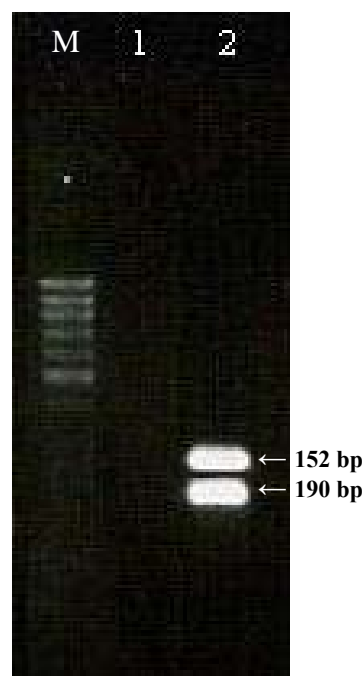
Fig. 3. Subtyping of avian influenza viruses in cloacal and tracheal swabs samples. Lane M, size markers (50 bp ladder, CinnaGen, Iran) lane 1, H 2 O control and lanes 2, ten \mu l of Multiplex RT-PCR products obtained by using primers specific to HA genes of the H5N1 and H9N2 viruses. The sizes of RT-PCR HA gene products are indicated by arrows.

To diagnose influenza, culture confirmation is a well-established laboratory technique and remains as the standard method in most clinical laboratories. Culture conformation is a combination of cell culture-based virus isolation (VI) and subsequent immunostaining; however, the requirements of maintaining tissue culture cells and infectious virus particles represent drawbacks in obtaining timely and consistent results [19]. Moreover, VI can detect only live virus; therefore the viruses inactivated during shipping or by disinfectants (which may be present in environmental samples) may be detected