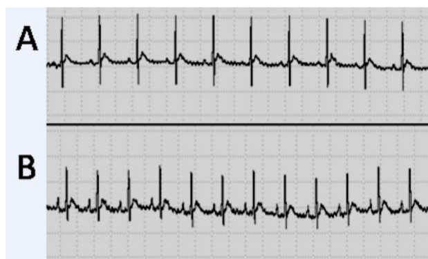
Fig. 2. Electrical activity of the heart in study groups. A sample electrocardiography electrocardiogram (lead II) of one animal of sham (A) and TBI groups (B). Electrocardiograph speed 50 mm/s and sensitivity 0.1 mV/mm (each large division on the recording is equivalent to 0.1 seconds on horizontal axis and 0.2 mV on vertical axis). Longer P wave duration and P-R interval in TBI group are seen. An increase in heart rate (shorter R-R interval) is seen after TBI, but overall heart rate was not significantly different between the two groups (see Table 5).

No differences ( P > 0.05 ) were found between TBI and sham groups in either of variables.