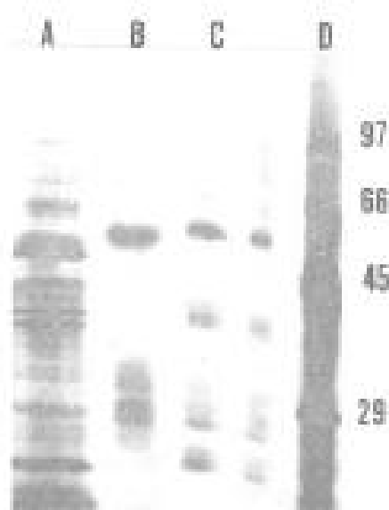
Fig. 2. SDS-PAGE analysis of the purified yeast derived HBsAg. A) total soluble extract from yeast cells expressing HBsAg. B) HBsAg isolated from a human carrier and C) purified recombinant yeast derived HBsAg. D) Molecular weight markers (kDa).

The sequence of the isolated HBsAg gene and its comparison to the reported sequence of the HBV subtype ayw (Gene bank accession number: X0ZH96) is shown in fig 1. The gene isolated in our study shows more than 90% homology with the reported ayw subtype. The primers used are shown underlined.