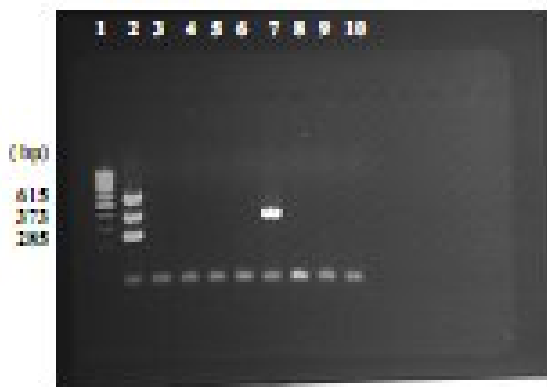
Fig. 2. Agarose gel (1.5%) electrophoresis of multiplex PCR products of specificity test. Lane 1, 100 bp DNA ladder; Lanes 2 and 7, S. typhi and S. paratyphi C , respectively as positive controls; Lane 3, Kelebsiella ; Lane 4, Shigella ; Lane 5, E. coli ; Lane 6, Proteus ; Lane 8, Staphylococcus ; Lane 9, Streptococcus and Lane 10, negative control (no DNA template).

Six strains of non- Salmonella Gram-negative bacteria, including Shigella , Kelebsiella , E. coli and Proteus , which have genetic properties similar to Salmonella species, along with Staphylococcus and Streptococcus from Gram-positive bacteria, were tested by primer-sets and no amplified fragments were seen (Fig. 2). The results of the specificity test obtained in this experiment was 100% in consistency with the works of other investigators [1, 6, 8, 9, 11, 14, 15].