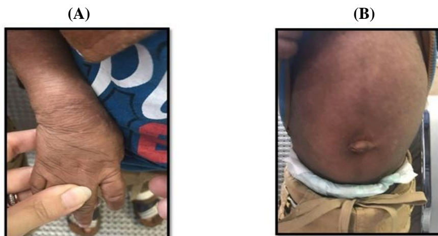
Fig. 1. Clinical findings. Ichthyosis (A) and hepatomegaly (B).

At the time of hospital admission, a significant ichthyosis and hepatomegaly (4 cm below rib edge in midclavicular line) was observed, however, no other signs and symptoms were detected. Growth and motor development milestones were normal according to the WHO standards [5] . Also, patients had normal muscular tone, and no eye and heart complications were detected. In primary investigations, heart, liver, and renal functions were normal. They only exhibited a mild increase in alanine transaminase (ALT) and aspartate transaminase (AST) levels, which were about 58 U/L and 63 U/L, respectively. Also, serum lipid profile for both patients was normal, except for triglyceride level, which was about 280 mg/dl.